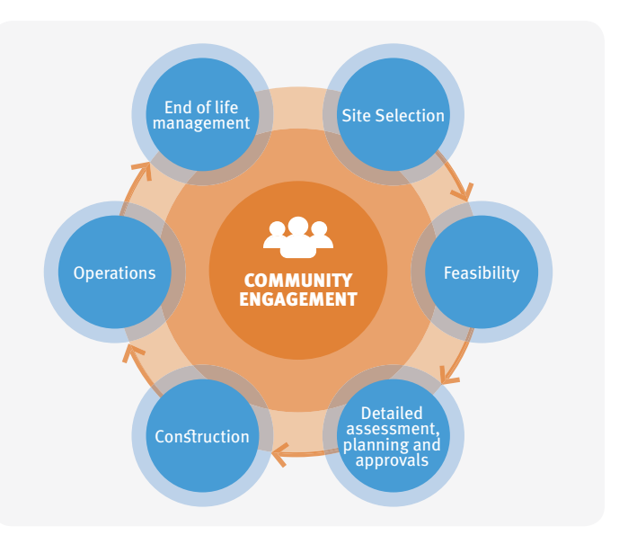
Figure 1 Community engagement across the solar farm lifecycle

Community engagement can make good projects great by ensuring they are delivered in line with community expectations and local circumstances. Effective engagement facilitates ongoing and open dialogue among communities, landowners, project proponents and governments throughout the solar farm lifecycle and associated decision-making process.