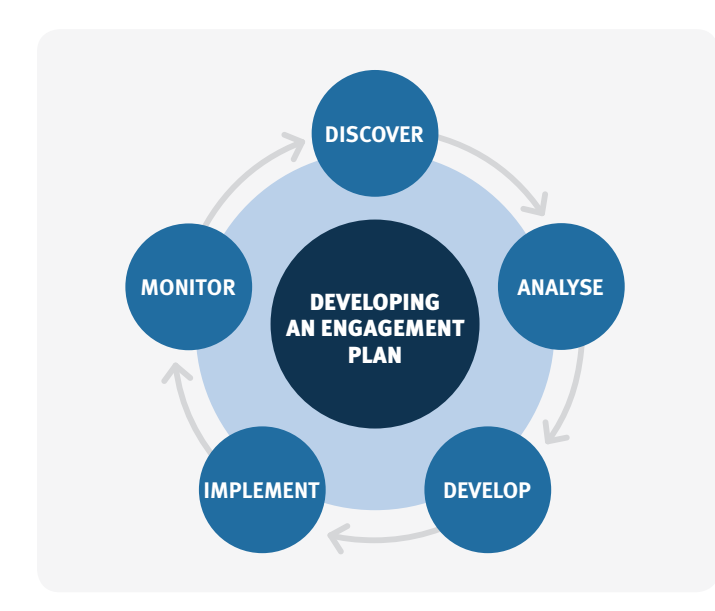
Figure 3 Community engagement cycle

There are five key steps for developing a Community Engagement Plan, all of which are interrelated. A successful Community Engagement Plan comprises a cycle of constant learning to ensure continuous improvement, as shown in Figure 3. Understanding these steps can help community members know what to expect of those proposing to establish and operate a solar farm.